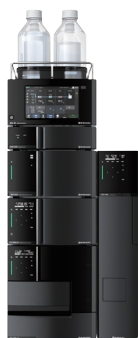
Ultra High Performance Liquid Chromatograph Nexera XS inert

Corrosion-resistant material ensures long-term stability and reliable data acquisition.